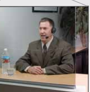
Interpreters listen to the service in the base language and interpret the service into a different language. The interpreted language is transmitted to individuals in the room who listen on a portable receiver with an earphone.

Portable receivers with earphones are worn by guests. Sound from the mixing console is broadcast to the receiver.